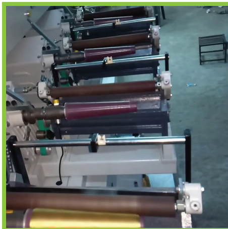
JARI CONNING MACHINE