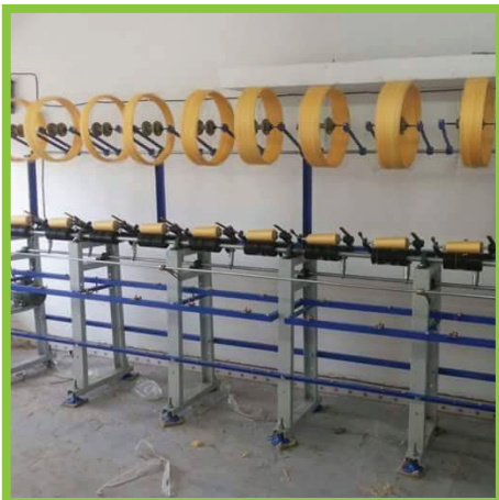
HANK TO CONE WINDER