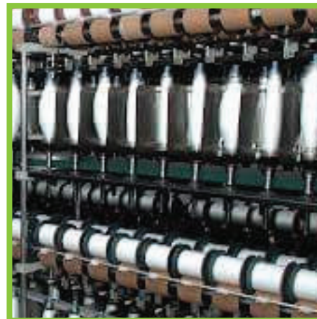
T F O