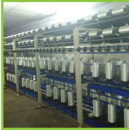
DIRECT T F O