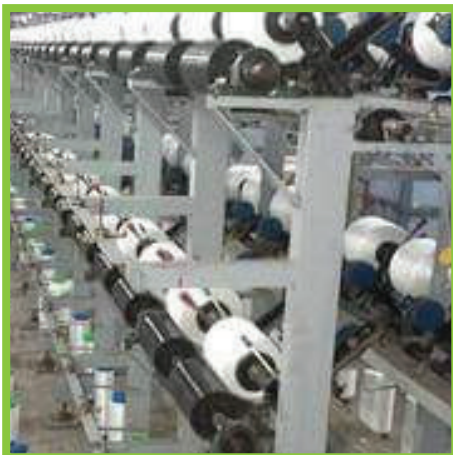
SOFT PACKAGE WINDER