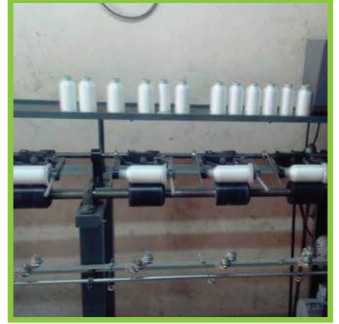
Y CONE WINDER