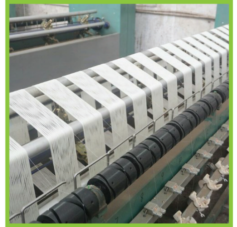
HANK MAKING MACHINE WITH DRUM