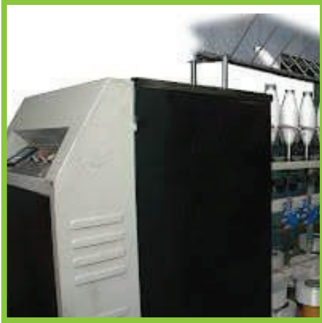
COPS WINDER MACHINE